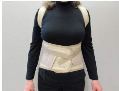
Reapply. Fitted view, front.