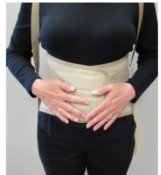
Attach straps to the front.