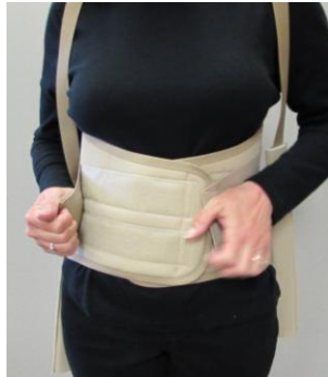
Attach the front