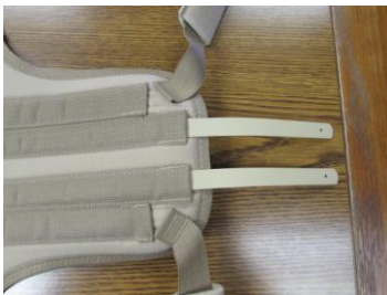
Shape and insert the steel stays