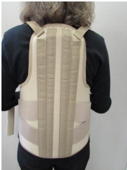
Center the back

Instructions for use / Instructions d'usage