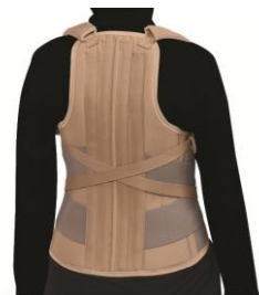
Fitted view, back.