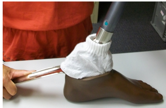
FIGURE 2. Remove Foot Shell, Step 2