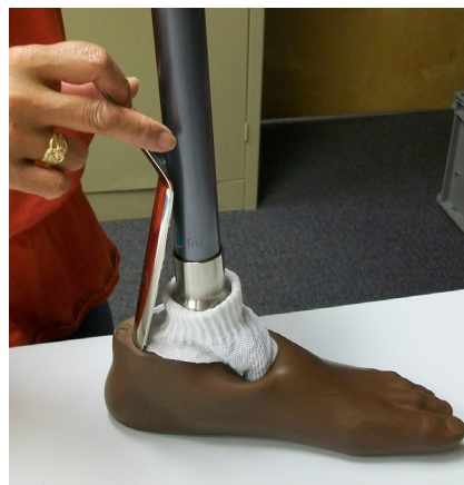
FIGURE 4. Insert Foot in to Shell, Step 5.