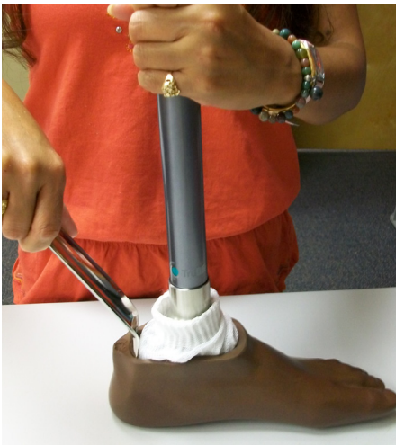
FIGURE 1. Remove Foot Shell, Step 1