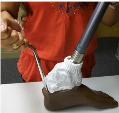
FIGURE 3. Insert Foot in to Shell, Step 4.